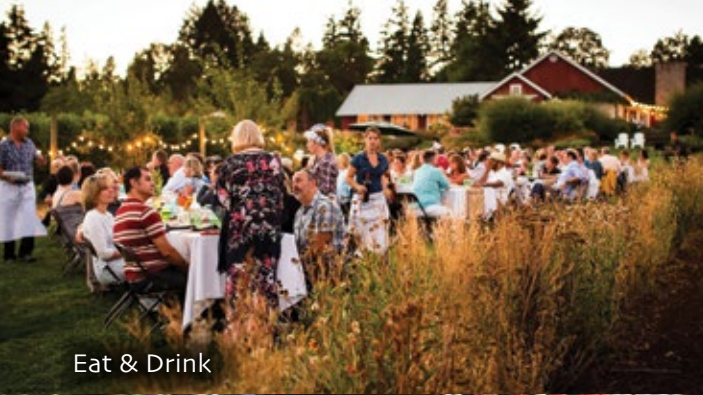
Eat & Drink