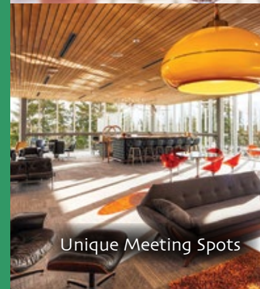
Unique Meeting Spots