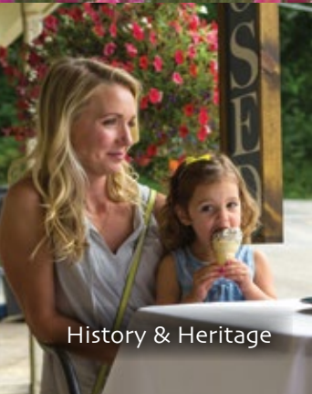
History & Heritage