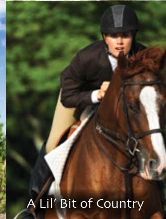
A Lil' Bit of Country